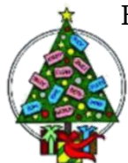
The Angel Tree

Each Christmas season Valley has an Angel Tree project. This year, we will be supporting Geauga County Family Services.